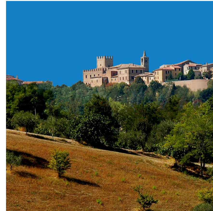
S. ANGELO IN LIZZOLA