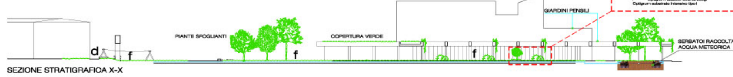
comparto 1a -Parco pubblico -scala 1:500 "tana-liberi tutti"